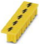
Warning cover, Strip, yellow, labeled, Mounting type: Plug in, Lettering field: 4.5 x 5.55 mm