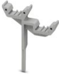
Marker carriers, gray, Unlabeled, Mounting type: Plug in, Lettering field: 4 x 10.5 mm

Please be informed that the data shown in this PDF Document is generated from our Online Catalog. Please find the complete data in the user's documentation. Our General Terms of Use for Downloads are valid ( http://download.phoenixcontact.com )