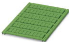
The figure shows the UCT-TM 6 version

UniCard materials for thermal transfer printer, for labeling Weidmüller, Conta Clip, and Klemsan terminal blocks, 60-section, can be labeled with THERMOMARK CARD and BLUEMARK LED, color: green